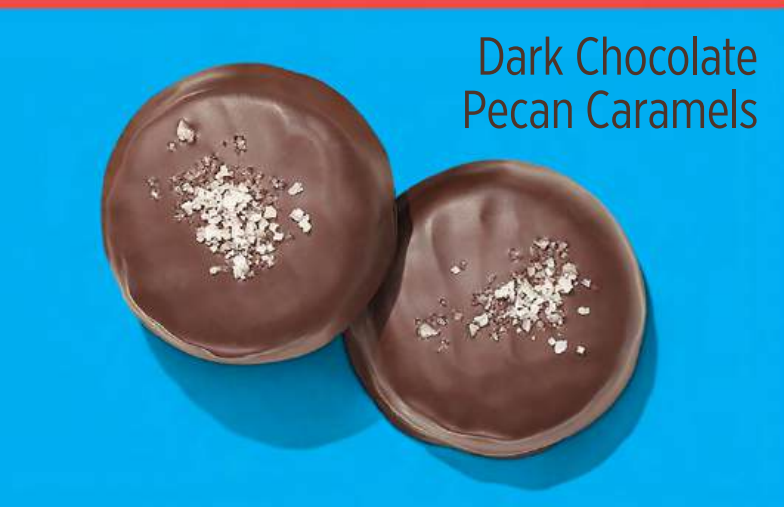
Dark Chocolate Pecan Caramels