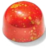
HAZELNUT CARAMEL *Contains nuts