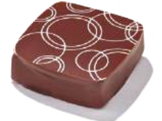
CHAMPAGNE *Contains alcohol