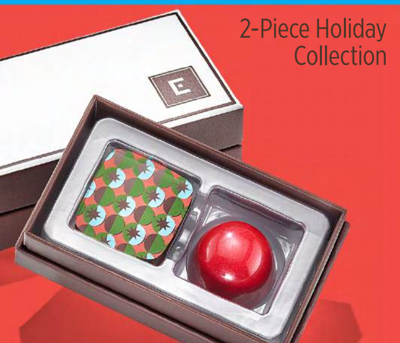
2-Piece Holiday Collection