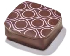
EARL GREY TEA