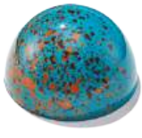
BUTTERSCOTCH BOURBON *Contains alcohol