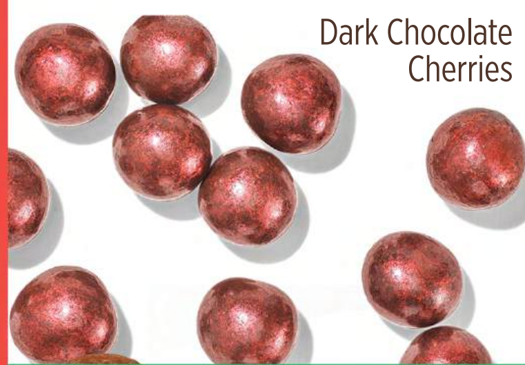
Dark Chocolate Cherries