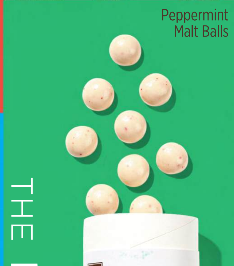
Peppermint Malt Balls