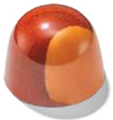
CARAMEL PECAN *Contains nuts