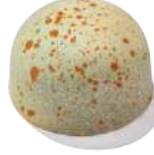
MACADAMIA PRALINE *Contains nuts