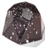
FLEUR DE SEL