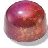
RUM CARAMEL *Contains alcohol