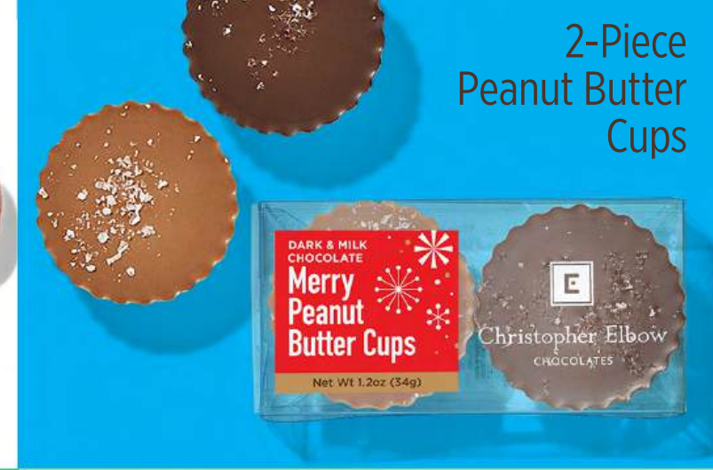
2-Piece Peanut Butter Cups