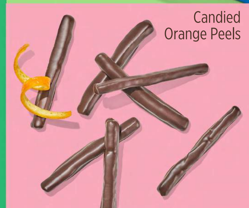
Candied Orange Peels